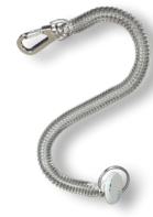
#GS1025 (11.25 in, adhesive disk)