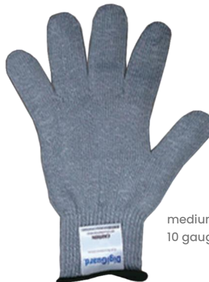
medium weight 10 gauge