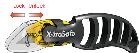
Manual Guard Lock